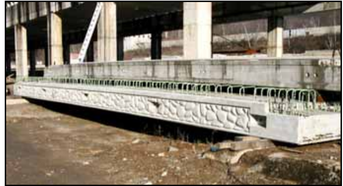
Exterior beams cast with a cobblestone finish.