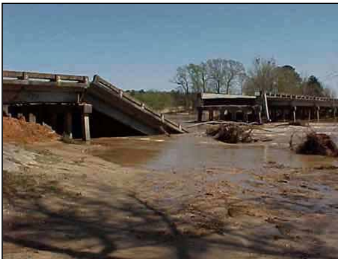
Story and photo improvised from Maine Trails Aug/Sept 06.

The photos and story above were submitted by The Fort Miller Co., Inc, Schuylerville, NY. Project design services were provided by Janssen & Spaans Engineering of Indianapolis, IN.