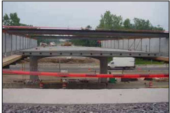
Girder-mounted hangers support slabs until pours and post-tensioning are complete.

The transverse steel beams seen above right were compression struts to prevent the beams from rotating while the panels were being erected. Since the panels were being supported on falsework eccentric to the beam, rotation had to be restrained until the joint was concreted and the transverse post tensioning installed.