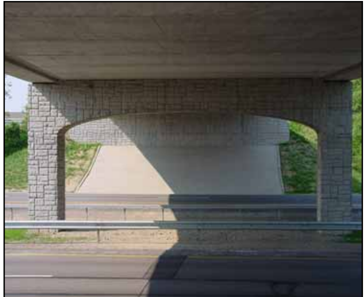
Edge girder finish matches abutments and center pier.

This system is similar to the Channel Bridge concept of years past. However, you do not have to “build a bridge to build a bridge”. The required shoring for the previous match-cast “U” shaped sections was expensive and slow. Both Hook Road and Farmington Road Bridges were the same, except for a slight change in the skew. The finished bridge spans were