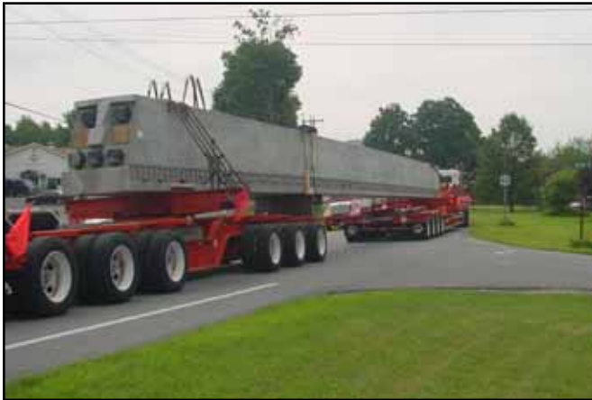
Girders shipped on special trailers- note the absence of a supporting ledge or shelf.