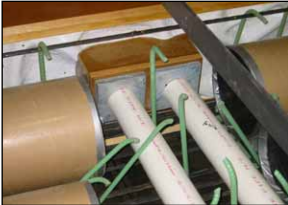
Inside a prestressed voided slab.