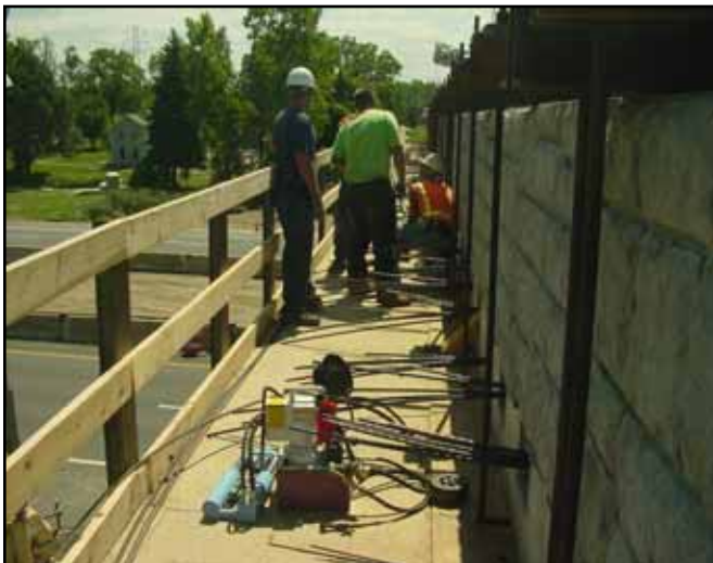
Transverse post-tensioning underway.

The transverse steel beams seen above right were compression struts to prevent the beams from rotating while the panels were being erected. Since the panels were being supported on falsework eccentric to the beam, rotation had to be restrained until the joint was concreted and the transverse post tensioning installed.