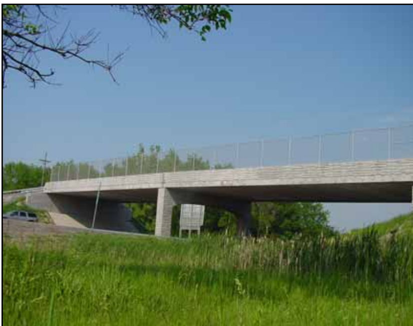
Hook Road over the New York State Thruway.

just under 100' and each bridge was 2-span continuous. The replaced bridges were four spans each.