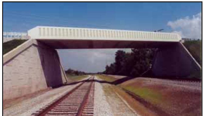
Sedley Bridge, Porter County, Indiana.

The photos and story above were submitted by The Fort Miller Co., Inc, Schuylerville, NY. Project design services were provided by Janssen & Spaans Engineering of Indianapolis, IN.